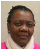
Marie J. Saint Clair Schervier Nursing Care Center