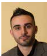
Francis Brosnan Beth Israel Medical Center- Kings Highway Division