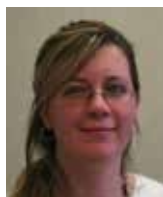
Holly Quinn Southampton Hospital