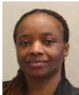
Constance Okpa St. Barnabas Rehabilitation & Continuing Care Center