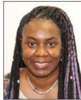
Kenya Coles Eastern Long Island Hospital