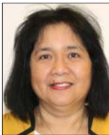
Azucena Leblanc Orange Regional Medical Center